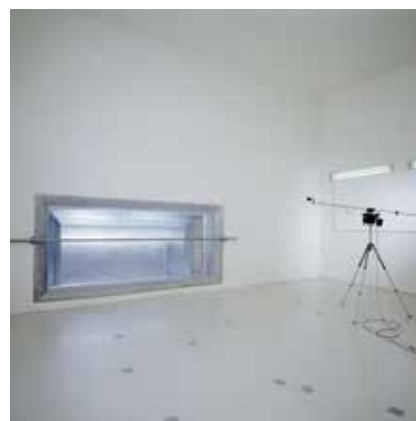
Lindab's sound laboratory is located in Farum, Denmark.