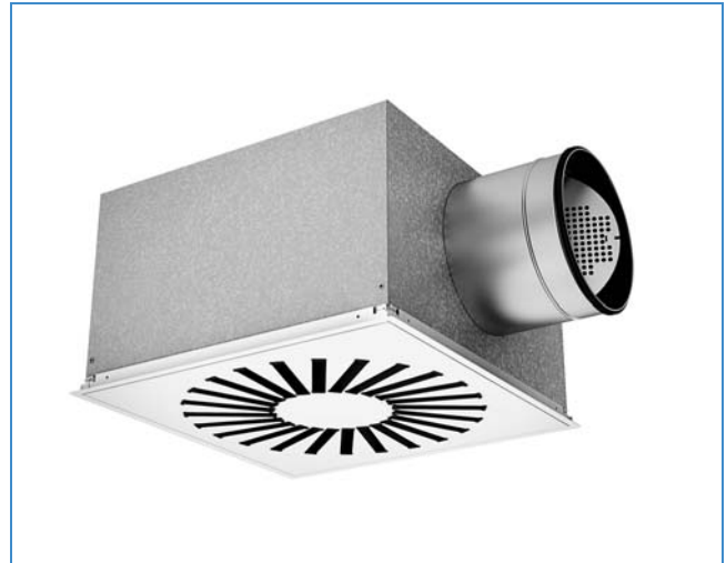
RS15 with plenum box type H