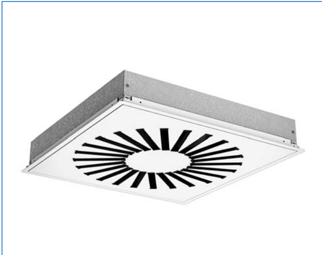
RS15 with grille box type V