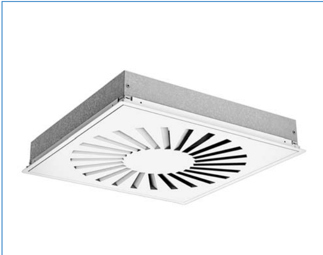
RS14 with grille box type V