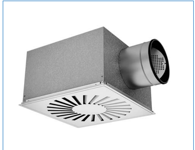
RS14 with plenum box type H