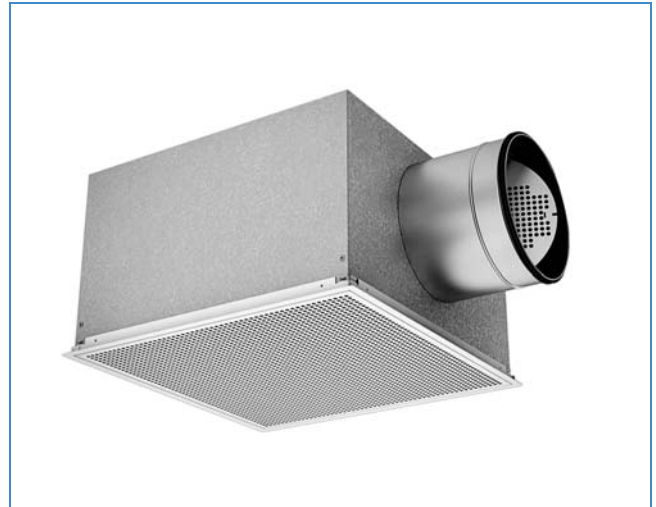
PS8 with plenum box type H