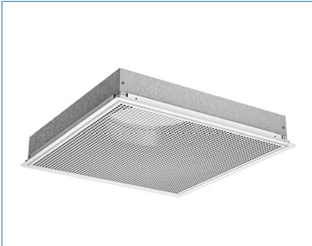
PS8 with grille box type V