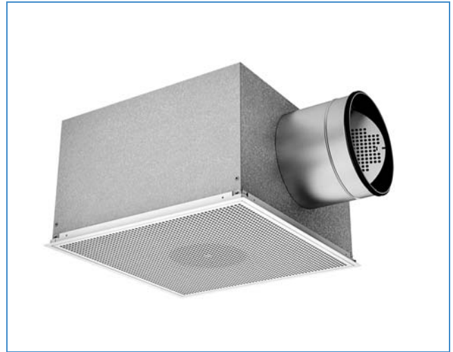
PS1 with plenum box type H