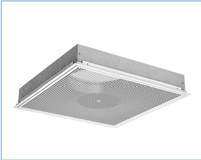
PS1 with grille box type V